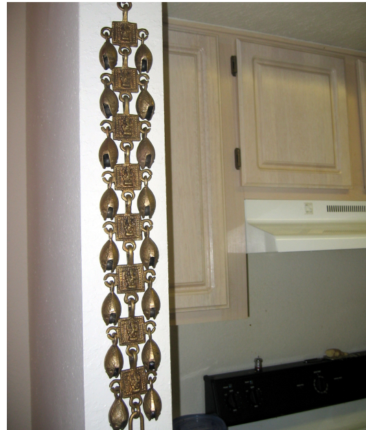
Figure 9 Bronze art object in Sheetal's American kitchen

Excited about living alone with her husband and decorating their new home in the U.S., Sheetal brought decorative objects with her from India on her very first visit to America. A wind chime suspended from the ceiling on top of the kitchen counter adds color to the light brown wooden cabinets, white floors, walls, and counter surfaces of Sheetal and Vikram's apartment kitchen. A bronze art object composed of Ganesha symbols and tinkling bells dangles down the narrow wall that defines the entrance of their open kitchen, expressing the couple's