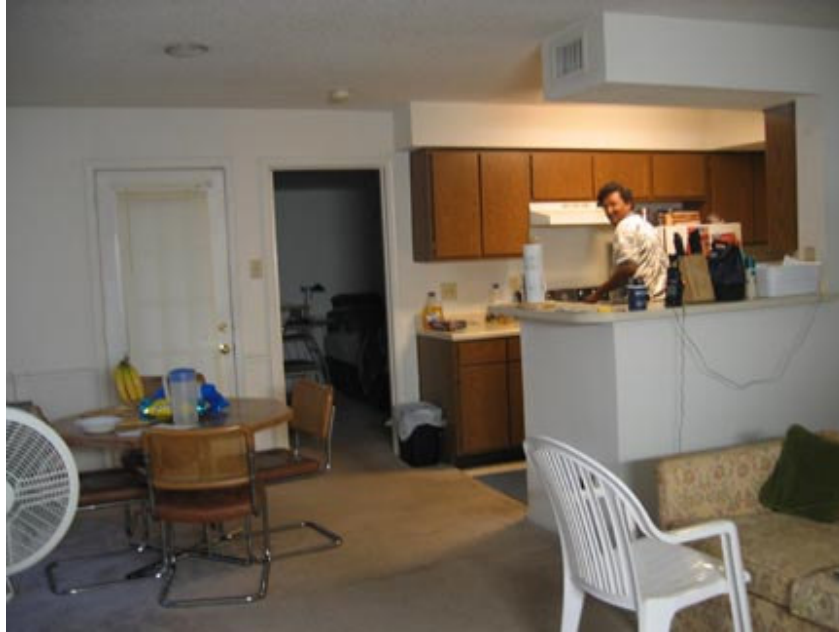
Figure 3 An open planned American suburban apartment kitchen in Virginia

daily life. The kitchen not only becomes a part of other living spaces of the house in this scenario, but also serves as a potential spillover area during large gatherings.