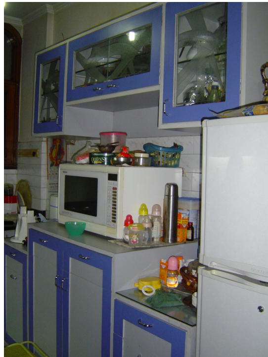
Figure 5 A customized storage cabinet in an apartment kitchen in India