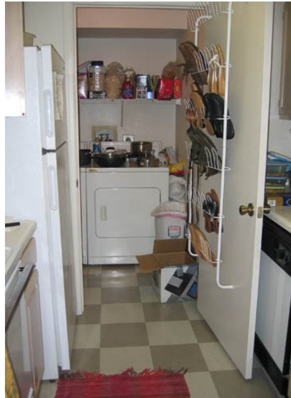
Figure 13 Shoe rack in Sheetal's American kitchen

Despite the presence of an altar in their kitchen, Vikram and Sheetal, who are extremely fond of buying shoes, have mounted their big shoe rack behind the door of the laundry space attached to their American kitchen. They comment, “We could not find any other place for this shoe rack in our apartment and do not like the idea of seeing shoes when we are spending private moments with each other in our bedroom.” 25 The storage closet next to the entrance is full of empty packing boxes they have saved to transport their electronic devices on their next move. Sheetal defends her choice: “I always keep the door to the laundry closed because I do not need to enter the laundry space on a regular basis.” Unlike other Indians who use the laundry space in their kitchen to store dry goods, she has consciously