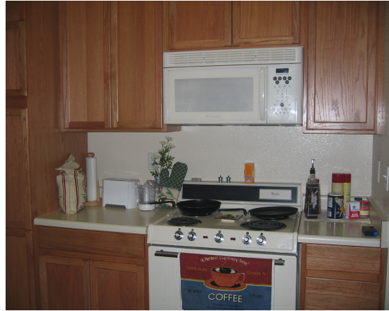
Figure 4 A modern suburban apartment kitchen in California

Inspired by the functionalist models of the 1920s and 1930s, the open design of the modern American kitchen features built-in cabinets and modern appliances flush with each other and the walls. This provides a uniform visual aesthetic characteristic of contemporary suburban apartment kitchens in the U.S. Mass-produced housing, with its standard interior design, became a cost-effective design solution during the post-war years. This led to the creation of communities with virtually identical kitchen designs throughout the United States. 8 In the interiors of these spaces, turning in any direction, one encounters the same spatiality, with every activity area clearly