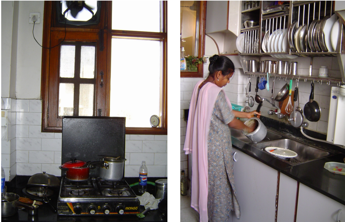
Figure 6&7 Electric stove and wash sink in an apartment kitchen in India

demarcated and incorporating fixed modern machines. In India, apartment dwellers and homeowners purchase their own appliances, which are neither fixed nor flush with the cabinets, and customize their kitchens according to their personal needs. In America, the kitchen, of all the domestic spaces, is foreign in terms of both planning and design. Indian immigrants have to adapt, not only to the openness and centrality, but also to the high-tech appliances and the overall standardization of their apartment kitchen designs. In many suburban American apartments, electric stoves replace the direct gas stoves, dishwashers substitute for the sinks where people wash utensils by hand and electric exhausts replace the window-mounted exhausts of Indian kitchens. Confronted by such a profound cultural, aesthetic, and technological difference, Indian immigrants become more aware of their own differences from native-born Americans. The conflict that arises out of this awareness concerns alternative strategies of adaptation: should the