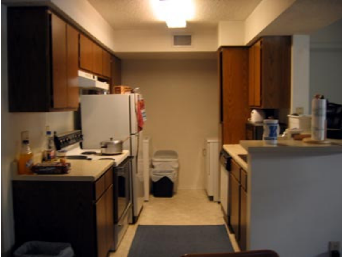
Figure 2 A suburban apartment kitchen in Richmond, Virginia

The open plan of the suburban apartment kitchens in the U.S., on the other hand, provides easy accessibility and visual openness toward other activity areas (entrance foyer, living room, and dining room). For many Indian immigrants living in these new domestic environments, the kitchen acts as a focal point of domestic life. One of the major issues these immigrants have to deal with while living in the U.S. is the issue of what kind of food they should eat. They give considerable importance to home-cooked food, especially Indian, in order to create a feeling of being at 'home'. 6 Despite their busy work schedules and fast-paced lives in the U.S., these immigrants spend a significant amount of time in their kitchens, cooking and socializing with their families and friends. Open planning (elimination of walls, low partitions) provides a dynamic view of cooking activities from a number of rooms, while placing the kitchen at the center of