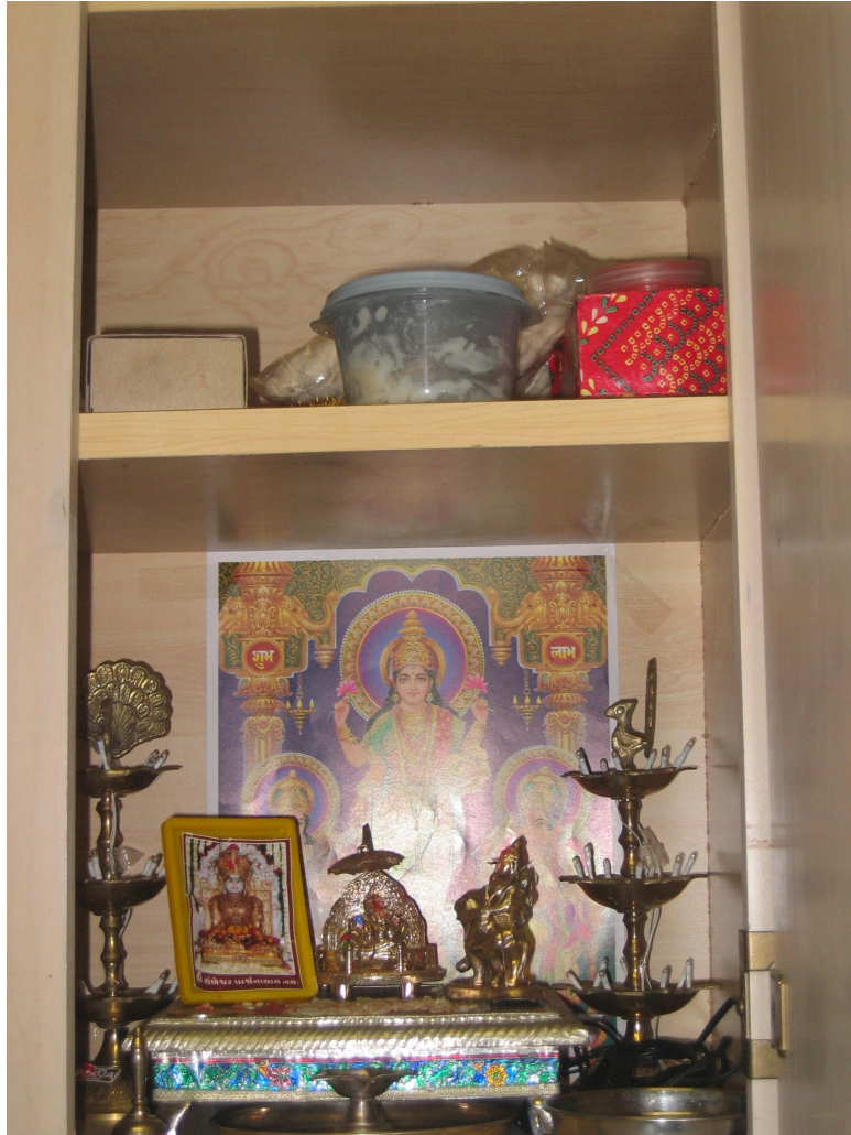
Figure 12 Altar in Sheetal's American kitchen cabinet

used to sit and pray in the traditional Hindu style in front of her altar on a regular basis. Like many Hindu families who position their altars in private rooms or in semi-private spaces, Sheetal's family have set up their altar in a special furniture cabinet in one corner of the lobby, isolated from the other living spaces of the house. 24 In contrast, in their American apartment, Sheetal and Vikram pray in a public space, standing in front of a built-in kitchen cabinet that they use to hold a religious shrine. Living in the constricted space of a one-bedroom modern American suburban apartment has inspired these immigrants to invent a new use for their kitchen cabinet, and to invent a new place and